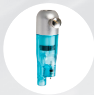
Silver Bullet Plus