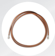
Braided Air Hose